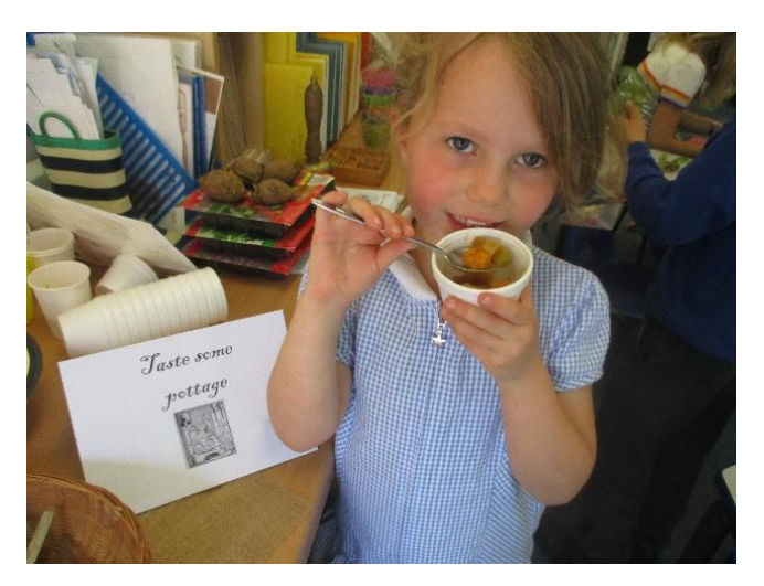
Tasting Tudor pottage which we had made earlier in the week.

Year 1 loved exploring lots of different activities during our Shakespeare afternoon. Thanks to all the grown ups who came into school and joined in so enthusiastically.