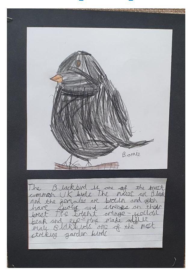
Blackbirds - Bonnie