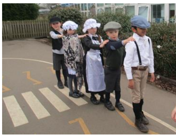
Year 2 travelled back in time on Monday and became immersed in Victorian School life.