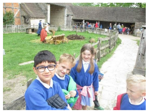
We enjoyed learning about the different jobs around the farm.