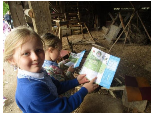
The maps came in very handy for practising our map reading skills